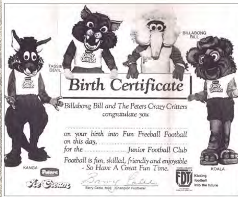
Fun Freeball Birth Certificates

In the late 1980s the concept of pre-competition activity continued to develop. This was called 'Freeball' and in 1990, the Football Development Trust moved to standardise the structure across all of the junior football districts. A major sponsor came on board in Peters Ice Cream which provided footballs and "Fun Freeball Birth Certificates" indicating when a player commenced Freeball.